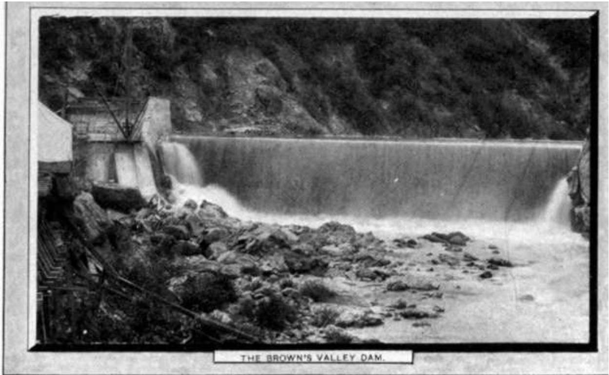
THE FLUME DOWN RIVER FROM THE DIVERSION DAM ALONG THE YUBA RIVER